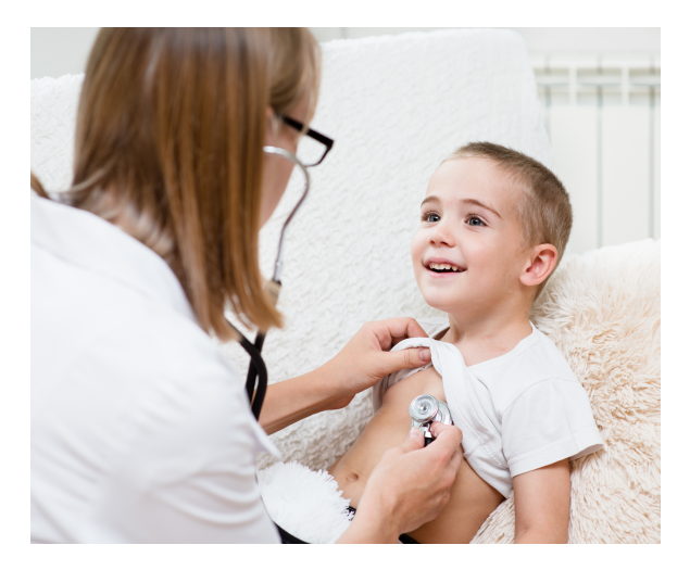
Vital Signs Monitor